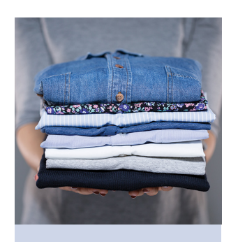
Individuals and businesses donate items to Goodwill