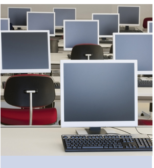
89% of revenue is directed to workforce development services and sustainability